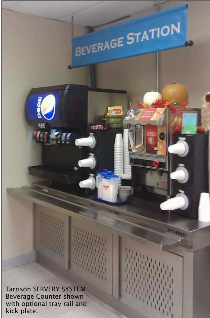
Tarrison SERVERY SYSTEM Beverage Counter shown with optional tray rail and kick plate.

Tarrison Beverage Counters provide an in-line solution to self serve beverage needs. Built to hold any self-dispensing equipment on the market, these units are built to last and come complete with an integrated drip plate to catch liquid spills. Take your beverage sales to a non-traditional location by using the standard casters supplied and adding a custom décor. The proper presentation can make your beverage sales even more profitable.