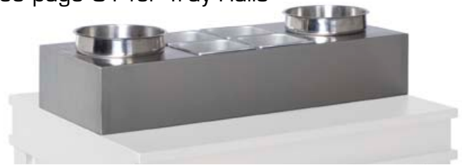
Combine Condiment and Beverage Area