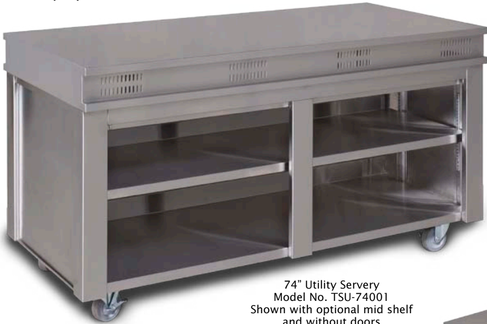
74" Utility Servery Model No. TSU-74001 Shown with optional mid shelf and without doors

Tarrison's Utility SERVERY SYSTEMS are available in a variety of sizes, straight in-line sections and a 90° corner unit. They are constructed of solid Stainless Steel and can be customized with designer inlays and tops. Tarrison Utility SERVERY SYSTEMS are designed for a variety of uses.