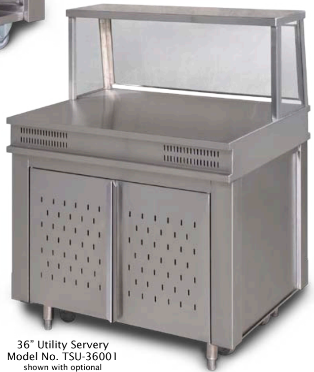
36" Utility Servery Model No. TSU-36001 shown with optional sneeze guard

Standard depth 32", available 36" and 42" on request