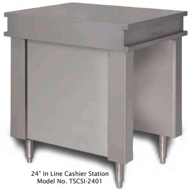
24" In Line Cashier Station Model No. TSCSI-2401