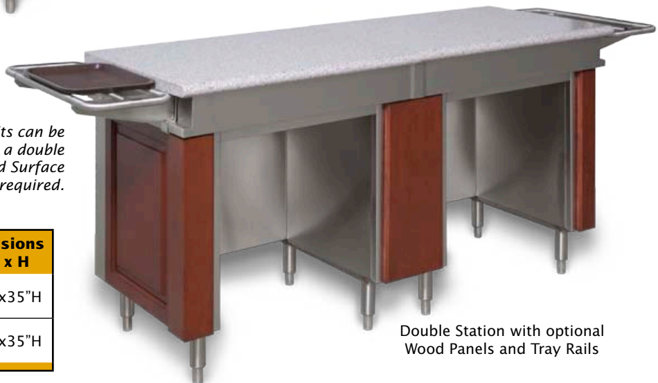
Double Station with optional Wood Panels and Tray Rails

Standard Cashier units can be banked together to create a double station – add Tray Rails, Solid Surface Tops or Front Panels as required.