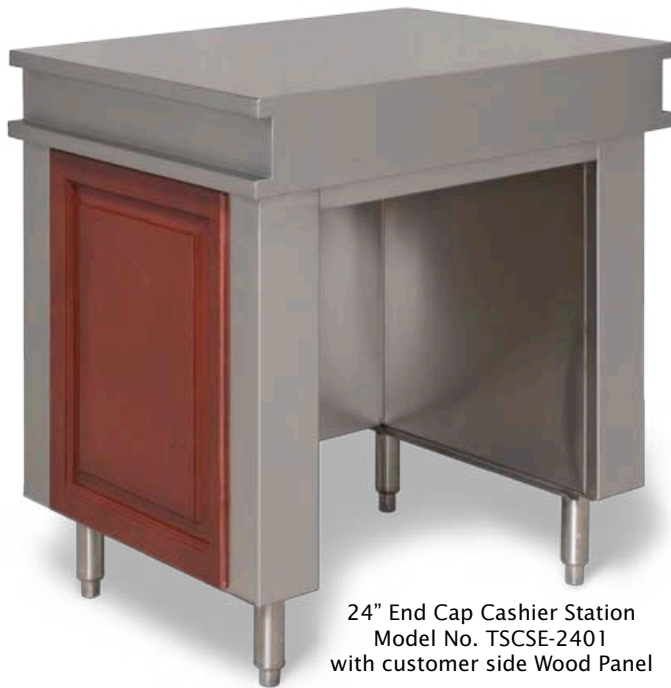
24" End Cap Cashier Station Model No. TSCSE-2401 with customer side Wood Panel

Tarrison Cashier Servery Systems make the perfect end cap to your new Servery line. Designed with the same Front and Back Ledge System as all other Tarrison Serverys, these units will have the same look and feel of custom design for your patrons with functionality built in for the operator.