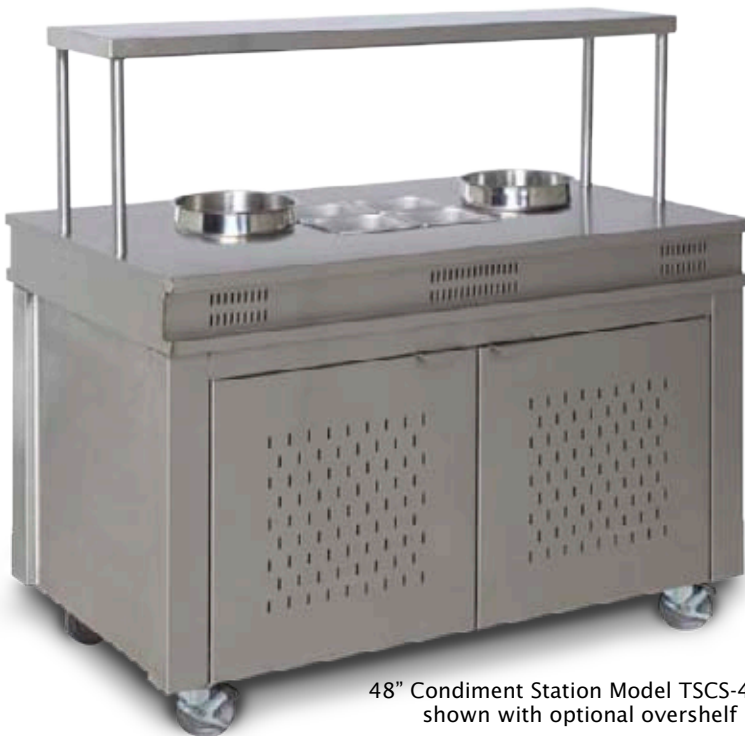
48" Condiment Station Model TSCS-4802 shown with optional overshelf