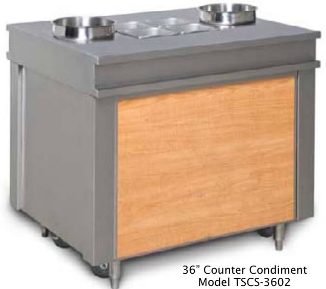
36" Counter Condiment Model TSCS-3602