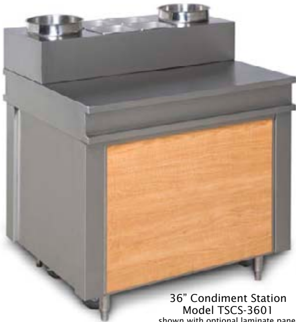
36" Condiment Station Model TSCS-3601 shown with optional laminate panel

Tarrison Condiment Centers provide an organized solution for your customer's condiment needs. Available as either counter top or free standing units to accommodate your facility's requirements, these units can be used in-line or as an island. Use the counter top version to supplement your existing cabinets. Use the free standing version to create a Condiment Center in either a counter top version or drop-in version as shown below.