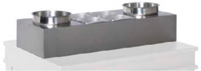
Combine Condiment and Beverage Area