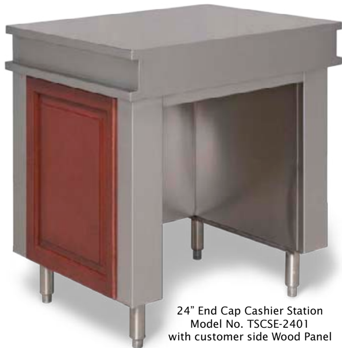
24" End Cap Cashier Station Model No. TSCSE-2401 with customer side Wood Panel

Tarrison Cashier Servery Systems make the perfect end cap to your new Servery line. Designed with the same Front and Back Ledge System as all other Tarrison Serverys, these units will have the same look and feel of custom design for your patrons with functionality built in for the operator.