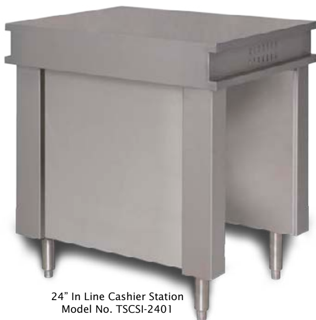
24" In Line Cashier Station Model No. TSCSI-2401