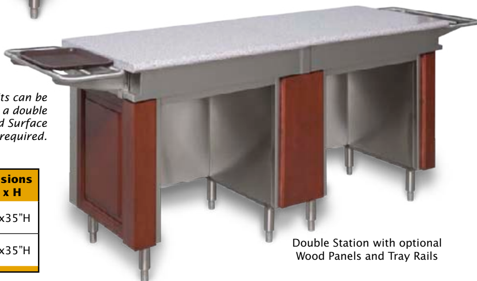
Double Station with optional Wood Panels and Tray Rails

Standard Cashier units can be banked together to create a double station – add Tray Rails, Solid Surface Tops or Front Panels as required.