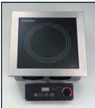
Model DI-35-1 3500W 15.25" x 15.25" OD