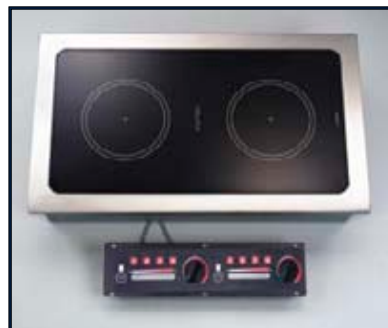
Model DI-60-2 2 x 3000W 27.5" x 17.75" OD