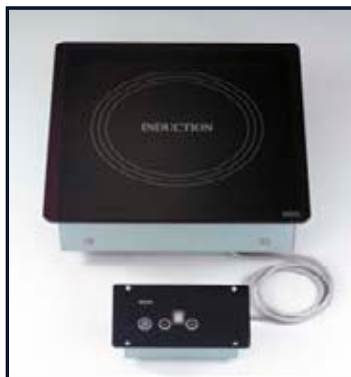
Model DI-18-1 1800W* *1500W in Canada Model DI-25-1 2500W 14.25" x 15.0" OD