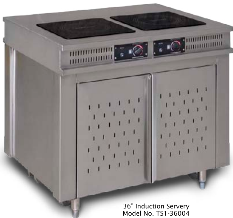
36" Induction Servery Model No. TS1-36004 shown with optional doors

Tarrison Induction Servery Systems provide energy efficiency, safety and performance for your in-line or remote cooking needs. The perfect System for sauté, pasta, omelettes and more, Tarrison provides the widest variety of Induction Systems in the industry. Choose from single or double hobs; flat top or wok; 1800, 2500 or 3500 watts of power.