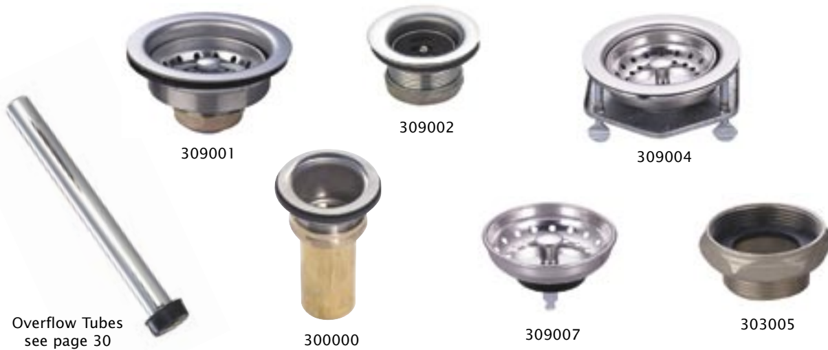
Overflow Tubes see page 30