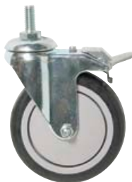
Threaded Stem Caster with Brake C5SPB