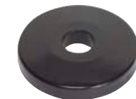
Fits all stem style casters