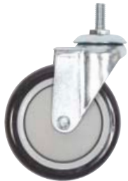
Threaded Stem Caster C5SPS