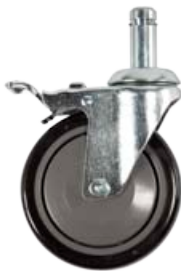
Non-Threaded Stem Caster with Brake C5STSPB