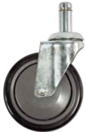
Non-Threaded Stem Caster C5STSP