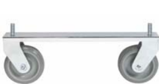
For use with Tie Bar Sold separately see page 62