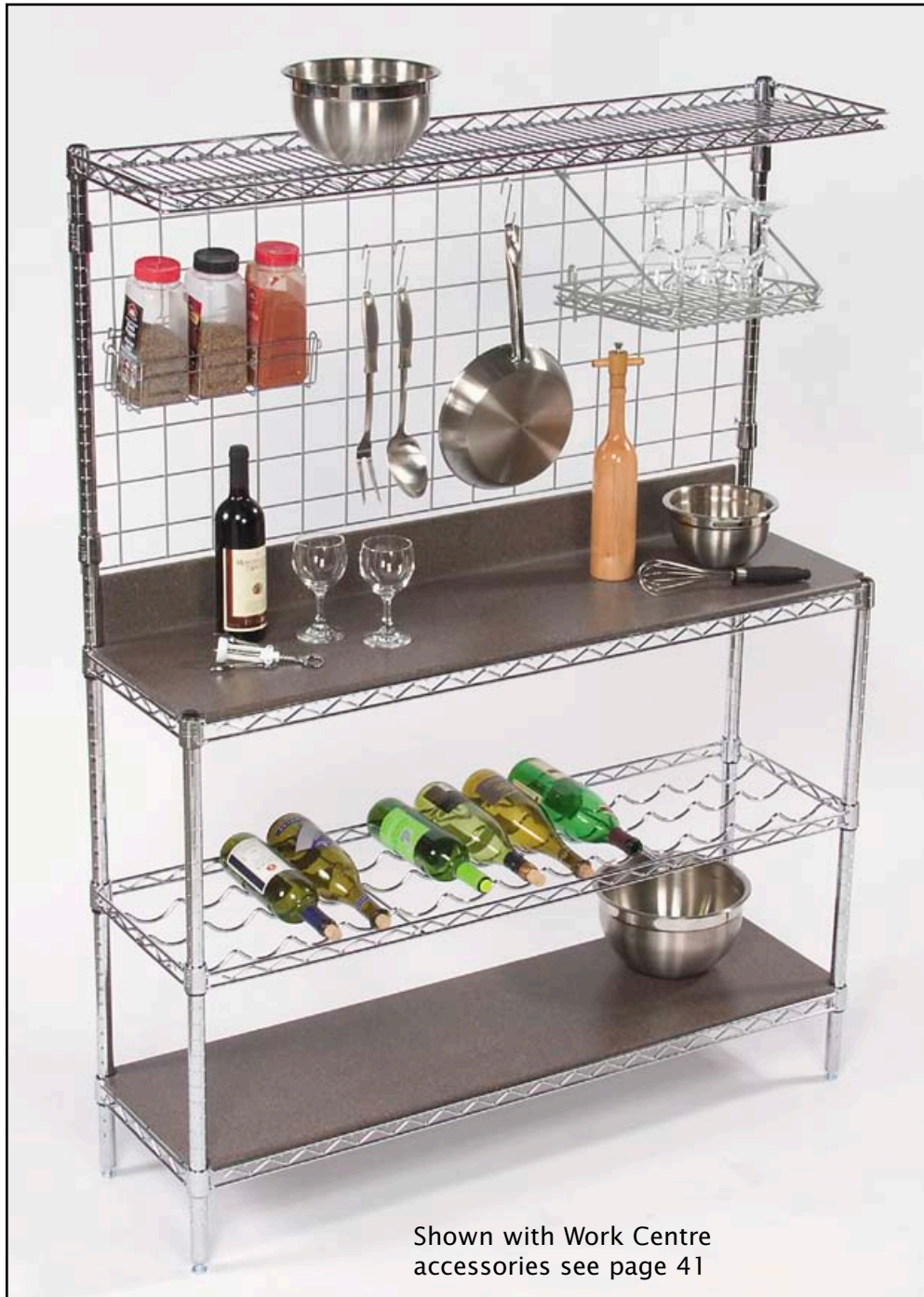
Shown with Work Centre accessories see page 41