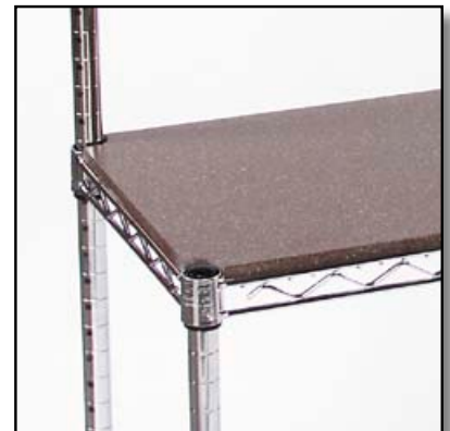
Flat surface with square edge (shown) or micro bevel edge