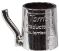
Shelf Collar Hook Model No. SCH1