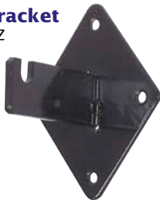
Wall Grid Bracket Model No. WGBZ