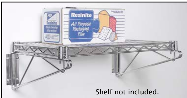
Shelf not included.

Order two Post Kits per unit and two Post Shelf Brackets per shelf. Shelves sold separately.