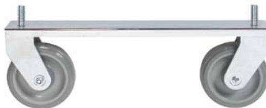
Shown with 5" Polyurethane Rigid Casters Model No. C5SPR