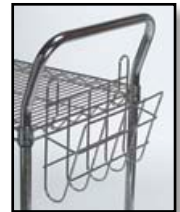
Document Holder see page 69