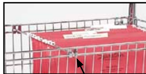
File Folder Dividers for Cart