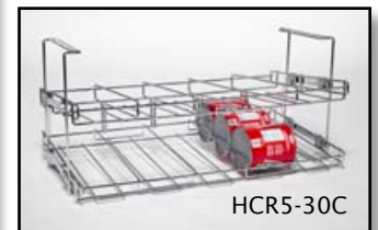
Chrome hanging rack for mounting under cupboards - 30 can capacity