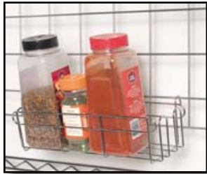
Spice Rack see page 69