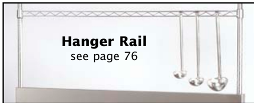
Hanger Rail see page 76