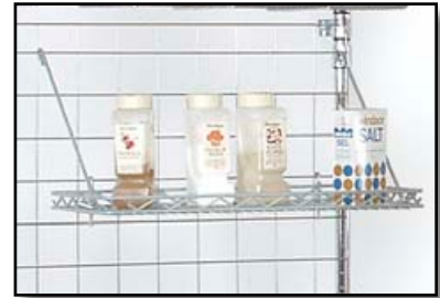
Small Grid Shelf see page 69