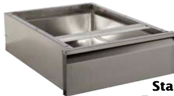
Stainless Steel Drawer Assembly see page 23