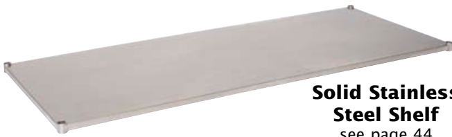
Solid Stainless Steel Shelf see page 44