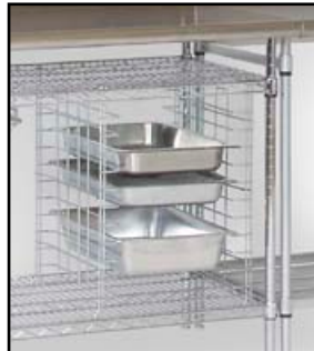
Tray Slide Inserts see page 77