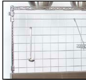
Back Grid Plate see page 68