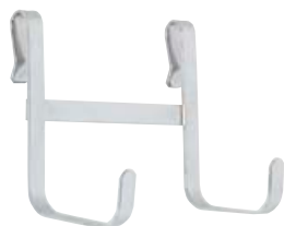
Double "J" Hook see page 69