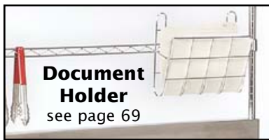
Document Holder see page 69