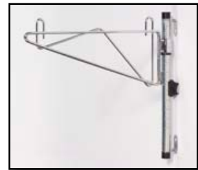
Adjustable Post Bracket System see page 67