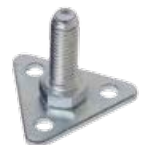
Foot Plates see page 79