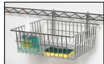
Utility Basket see page 69