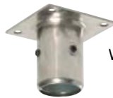
Wood Top Brace