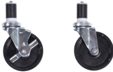
Work Table Casters for galvanized legs