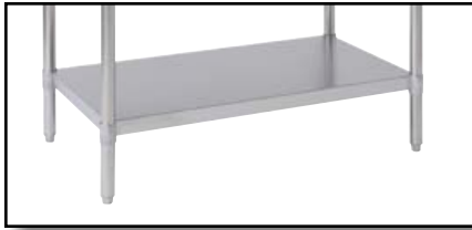
Stainless Steel Undershef for Worktable