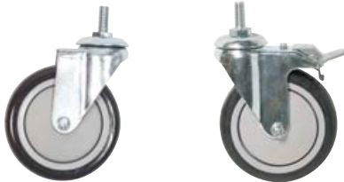
1" Post Casters