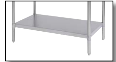
Galvanized Undershef for Worktable